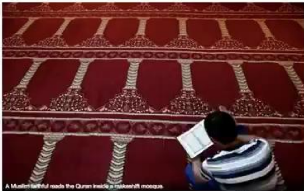
A Muslim faithful reads the Quran inside a makeshift mosque.